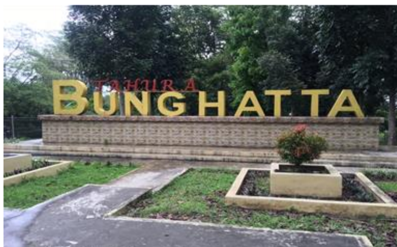
Figure 1. Bung Hatta Grand Forest Park