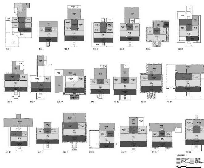
Figure 3: Floor Plan

Beyond lanjar , there is a space called dapua (kitchen). The kitchen is in close proximity to the main residence. The kitchen floor is constructed up of boards that have been stretched out.