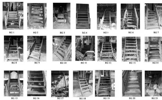
Figure 8: Elements of the Ladder

Rumah Gadang Kajang Padati is a house in the shape of a stage, similar to a house in the darek area. Consequently, it requires a ladder to climb the house. The house's main stairwell runs parallel to the entryway, which is located in the center. The number of rungs is odd, with 5,7,9 being the greatest odd numbers. A small carving may be found on the stair grip and the stair cover. The average height of the stairs from ground level is roughly 1.5 meters.