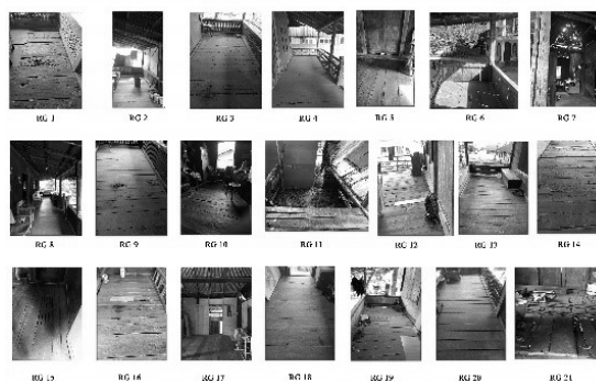
Figure 7: Elements of the Floor

Boards are stacked transversely on the floor to form the floor material. There are minor holes in the house's floor. When the inhabitants are sweeping, these little holes are used to remove dust waste. The holes also serve to drain the water used to shower the corpse of family members before burial.