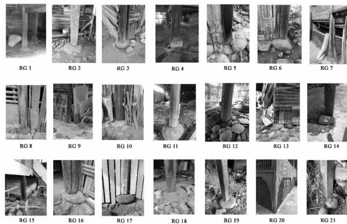
Figure 9: Elements of the Foundation

All houses use umpak foundation stone. The pattern of the shape of the column varies; some are in the form of circles, others are rectangular and octagonal.