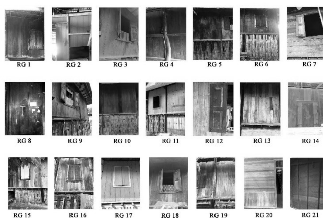
Figure 6: Elements of the Wall

front wall material of the house is wood with a plank arrangement, while the back wall is made of woven bamboo. Some carvings are found on the inner wall in several houses. There are also openings for doors and windows on the walls. The shape of the doors and windows retains its original form and thus the characteristics of the house. On the doors and windows, there are also carvings.