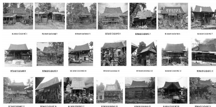
Figure 5. Elements of the Roof

Based on observations in the field, all houses retain their original shape (flat roof), which is the metaphoric manifestation of the pedati cart being hauled by a buffalo/cow. A zinc roof is the most commonly used roofing material nowadays, while all dwellings in the past had ijuk/rumbio roof. In some homes (for example, homes 1 and 6), the roofs have a new shape as a result of the installation of a new function.