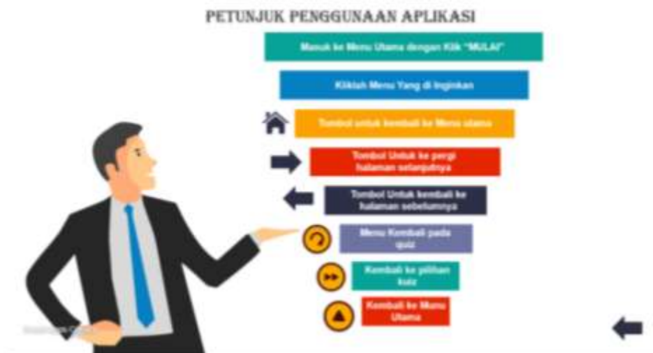
Figure 3. Instructions Menu Page

e-module. There are home, back, and next buttons on the instructions page. Figure 3 illustrates the layout of the instruction menu page.