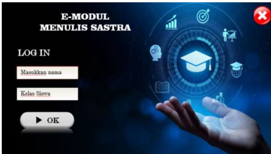
Figure 1. Cover