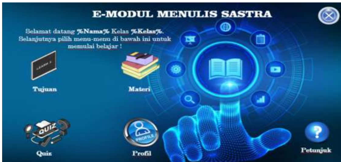
Figure 2. Main Menu Page