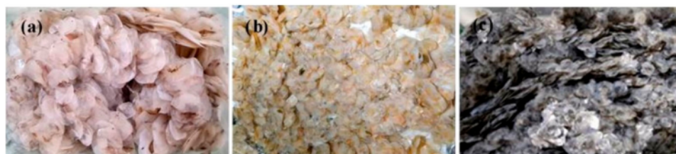
Figure 1. Scales of Giant gourami (a), Common carp (b), and Tilapia (c) used in this study.