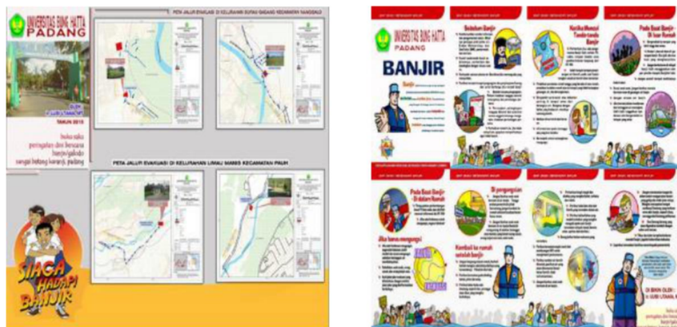
Figure 4. Pocket book: Ready to accept floods