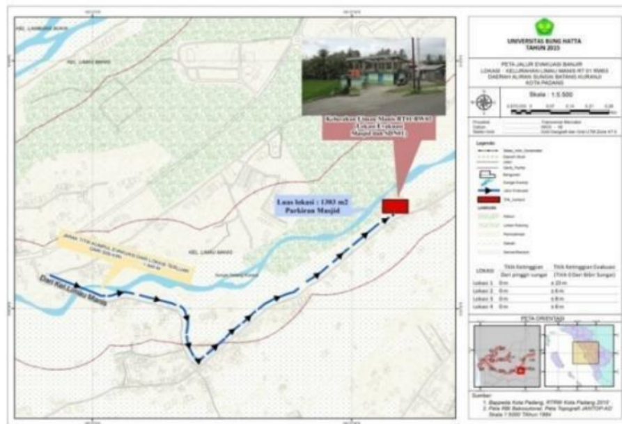
Figure 1. Map of Routes for Evacuation and Shelter Limau Manis