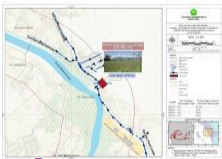
Figure 2. Map of routes for evacuation and Shelter Surau Gadang