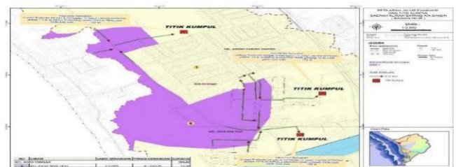
Figure 1: Map of Routes for Evacuation and Shelter Pasie Nan Tigo (down Stream)

By using image Citra map scale 1:5.000, map of DEM and map tematik. processed with the Quantum ArgisX got by band evakuasi of at DAS Air Dingin DAS Water (scale 1:70.000):