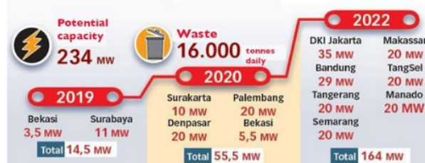
Figure 1. The development plan of Waste to Energy plants in Indonesia [11]

By regulation, PT. PLN is not obligated to develop such plants but is mandatory to buy the electrical power from WTE plants. To promote the WTE implementation, the Indonesian government has set a relatively high price for the WTE-generated electricity i.e., USD 13.3 per kWh based on Presidential decree No 35/2018. Local authorities are therefore strongly urged to actively contribute to developing the plants in their regions. Nowadays, the Indonesian government fosters WTE projects development in several cities such as Jakarta, Tangerang, Bandung, Surabaya, and Makassar (see figure 1). Though the provision of infrastructure facilities is fully under government responsibility, the ability to realize them could not be fulfilled solely. Given the importance of public facilities and the limitedness of public sources, the government strongly encourages the involvement of private sectors.