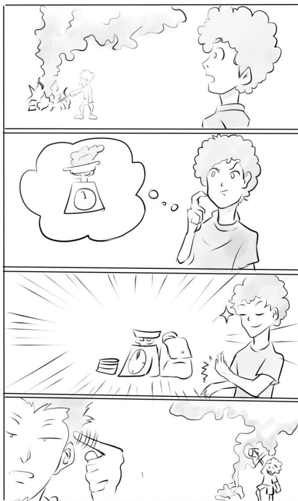
Fig. 1. Manggantang Asok Comic Strip