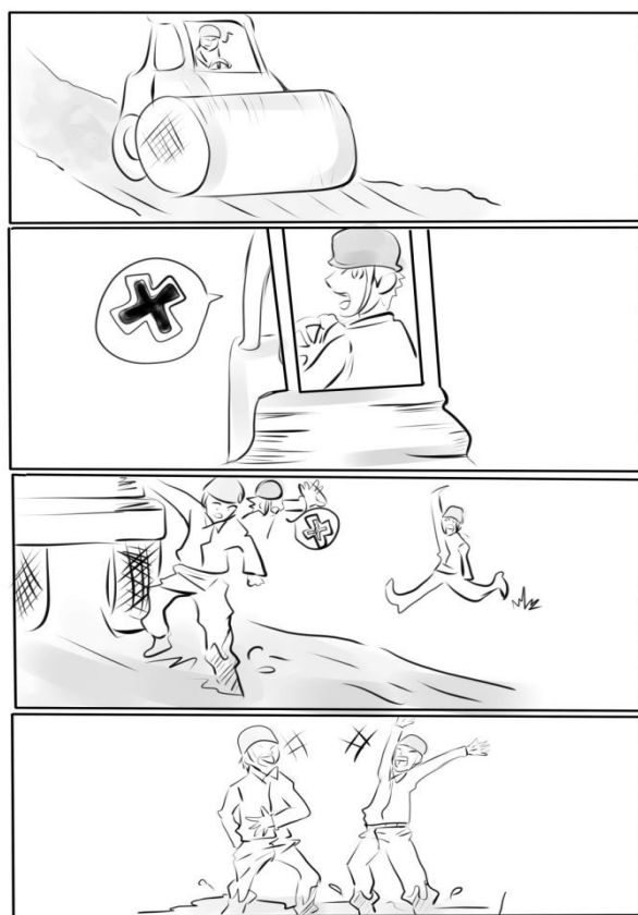
Fig. 2. Konco Palangkin Comic Strip